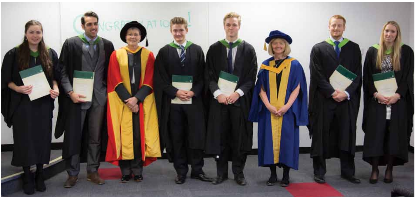
Graduates of the Intercalated BSc in Applied Health

The Medical Education strand of the Intercalated B.Sc. Applied Health Suite ran for the first time in 2012-13, with 7 students, including 1 external student being recruited. In 2013-14, this rose to 9 students, including 3 external. For 2014-15, 12 students, including 1 external, have been registered to date.